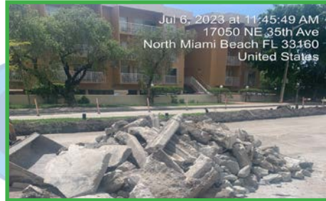
Eastern Shores Watermain Rehabilitation

Jul 6, 2023 at 11:45:49 AM 17050 NE 35th Ave North Miami Beach FL 33160 United States