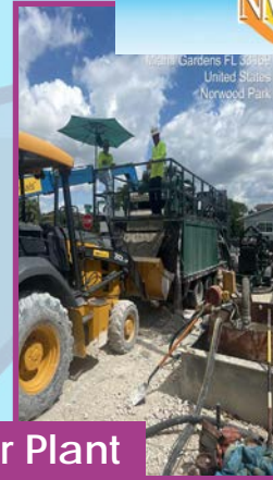
Corona del Mar Sewer System Phase 2

16000 Gardens FL 33160 United States Norwood Park