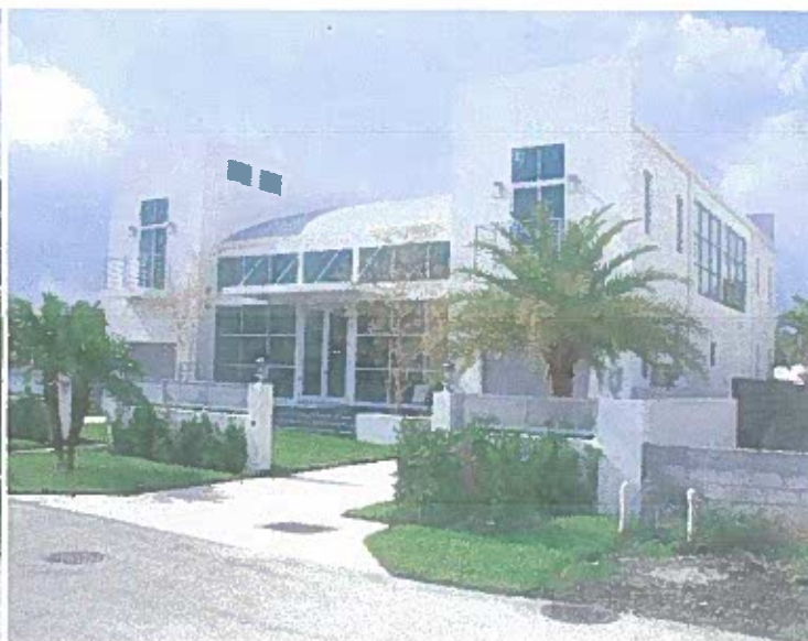
Rear Views: taken 6/21/11: