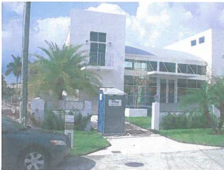
Front View: taken 6/21/11:

If using the Elevation Certificate to obtain NFIP flood insurance, affix at least two building photographs below according to the instructions for Item A6. Identify all photographs with: date taken; "Front View" and "Rear View"; and, if required, "Right Side View" and "Left Side View." If submitting more photographs than will fit on this page, use the Continuation Page, following.