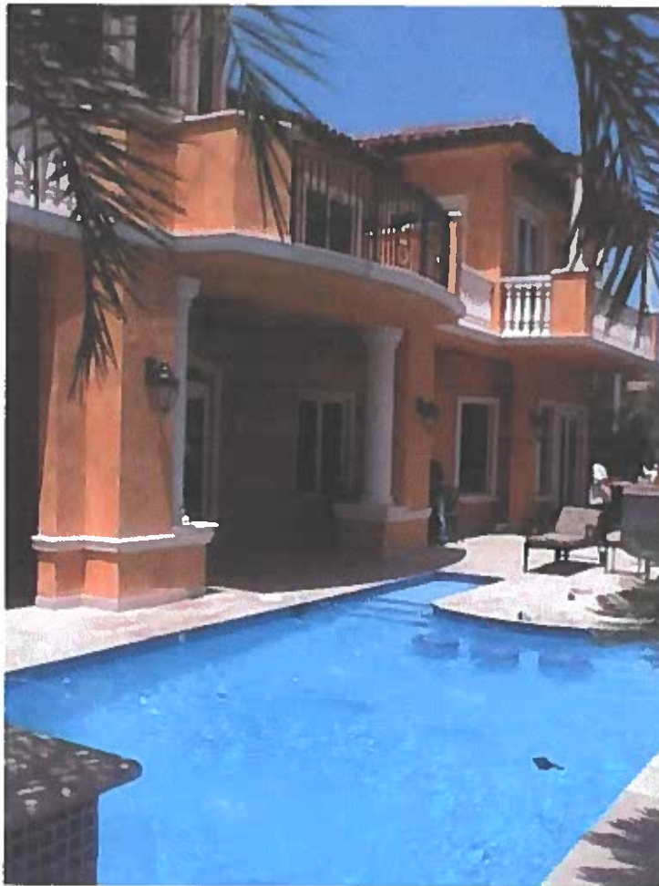
REAR VIEW AUGUST 2, 2008