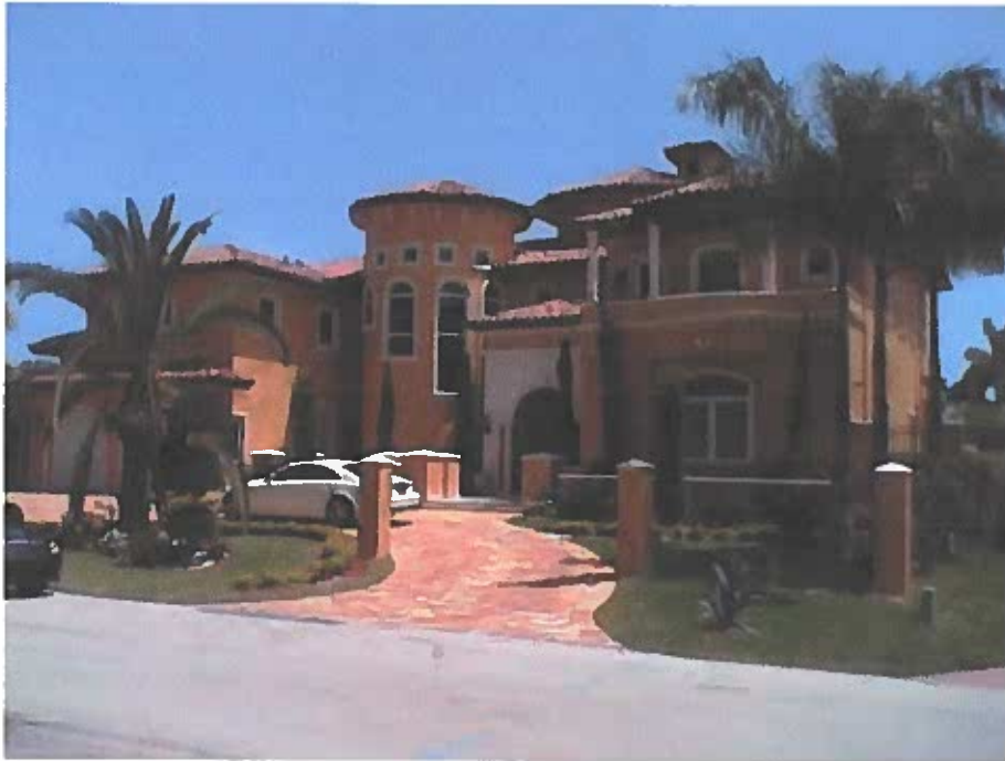
FRONT VIEW AUGUST 2, 2008

If using the Elevation Certificate to obtain NFIP flood insurance, affix at least two building photographs below according to the instructions for Item A6. Identify all photographs with: date taken; "Front View" and "Rear View"; and, if required, "Right Side View" and "Left Side View." If submitting more photographs than will fit on this page, use the Continuation Page, following.