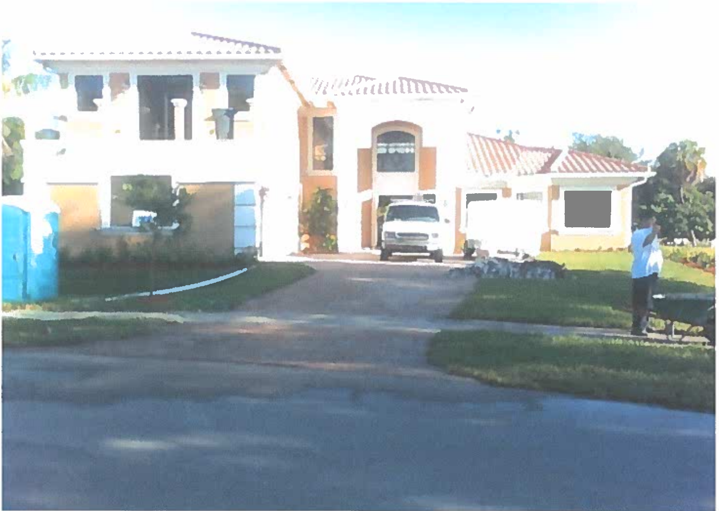
DECEMBER 14, 2009, FRONT VIEW

19691 Northeast 22nd Road North Miami Beach, FL 33179