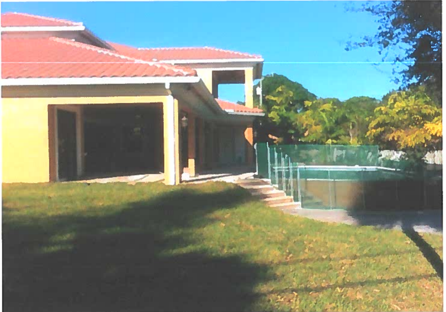
DECEMBER 14, 2009, REAR VIEW