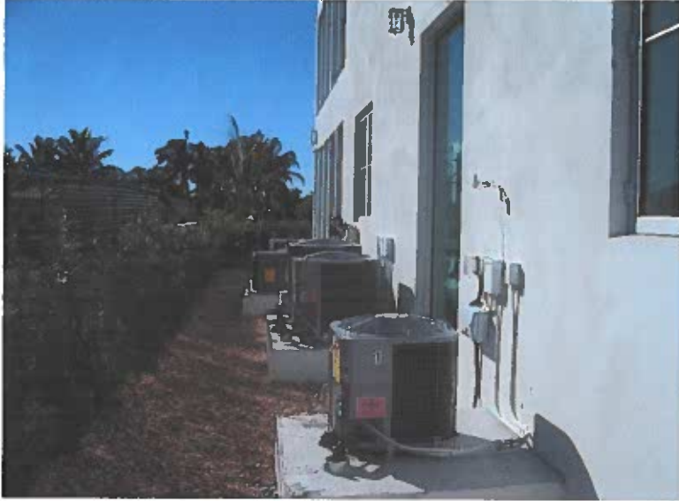
West Side: taken 1-27-2010