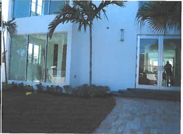
Rear Views: taken 1-27-2010