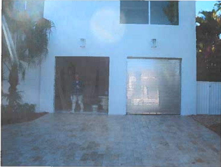
Front View: taken 1-27-2010

If using the Elevation Certificate to obtain NFIP flood insurance, affix at least two building photographs below according to the instructions for Item A6. Identify all photographs with: date taken; "Front View" and "Rear View"; and, if required, "Right Side View" and "Left Side View." If submitting more photographs than will fit on this page, use the Continuation Page, following.