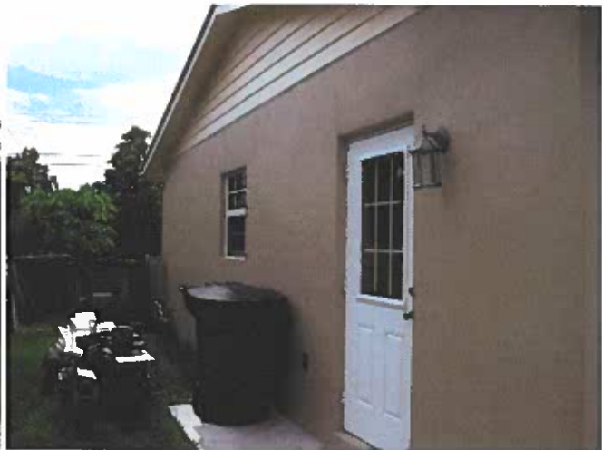
Left Property Picture