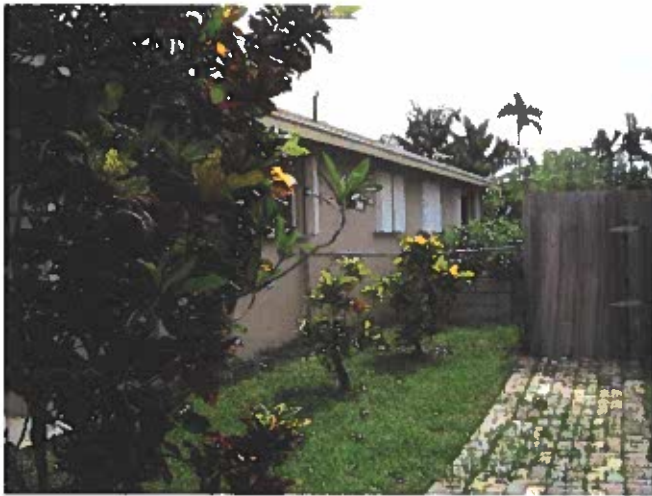
Right Property Picture