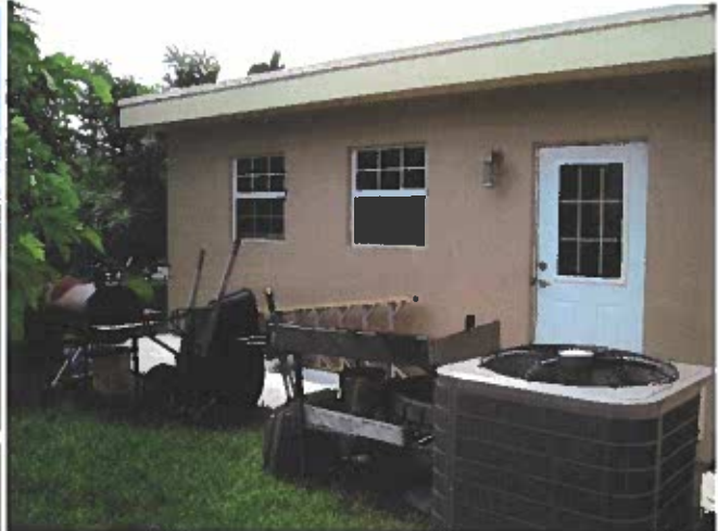
Rear Property Picture 7/13/2010