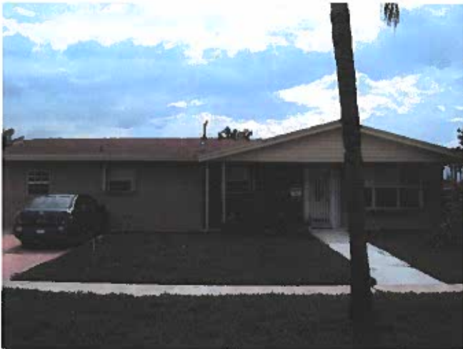
Front Property Picture 7/13/2010

If using the Elevation Certificate to obtain NFIP flood insurance, affix at least two building photographs below according to the instructions for Item A6. Identify all photographs with: date taken; "Front View" and "Rear View"; and, if required, "Right Side View" and "Left Side View." If submitting more photographs than will fit on this page, use the Continuation Page on the reverse.