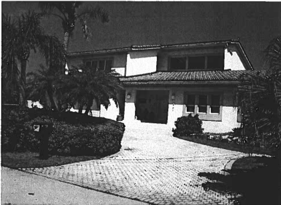
Rear View Date Taken 03-19-2010