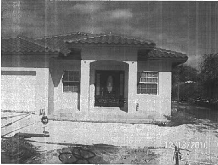
Front View 12/13/2010

If using the Elevation Certificate to obtain NFIP flood insurance, affix at least two building photographs below according to the instructions for Item A6. Identify all photographs with: date taken; "Front View" and "Rear View"; and, if required, "Right Side View" and "Left Side View." If submitting more photographs than will fit on this page, use the Continuation Page, following.