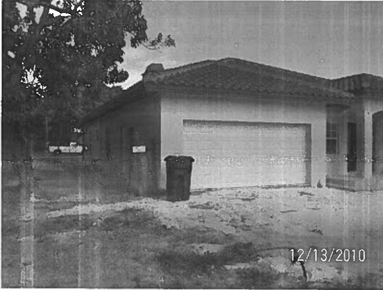
Left Side View 12/13/2010