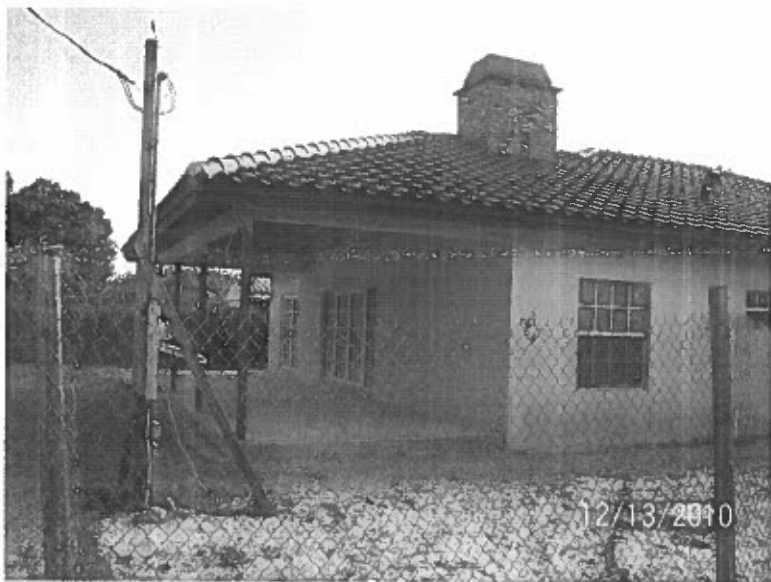
Side View 12/13/2010