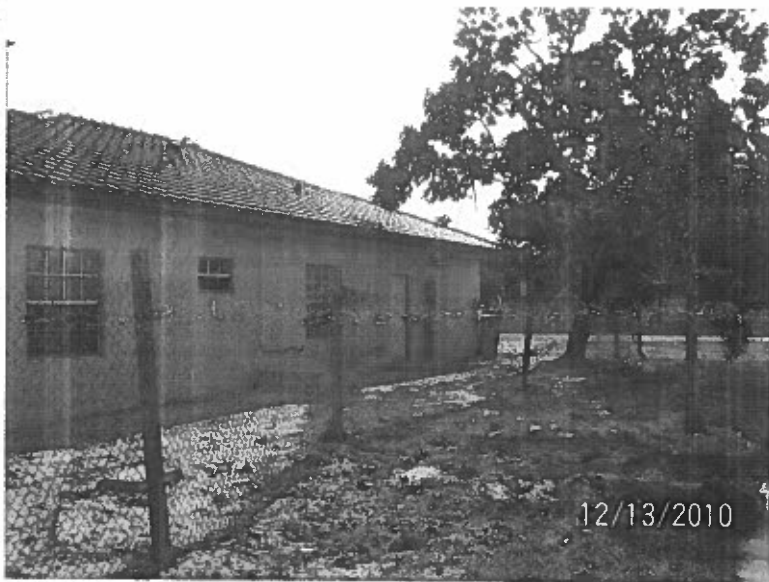
Rear View 12/13/2010

If using the Elevation Certificate to obtain NFIP flood insurance, affix at least two building photographs below according to the instructions for Item A6. Identify all photographs with: date taken; "Front View" and "Rear View"; and, if required, "Right Side View" and "Left Side View." If submitting more photographs than will fit on this page, use the Continuation Page, following.