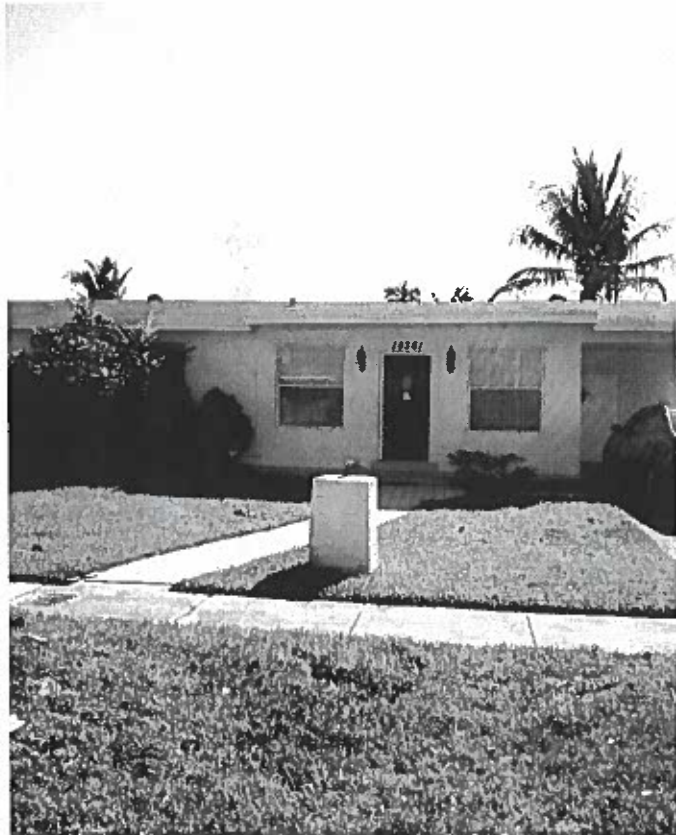
FRONT VIEW 04/02/11