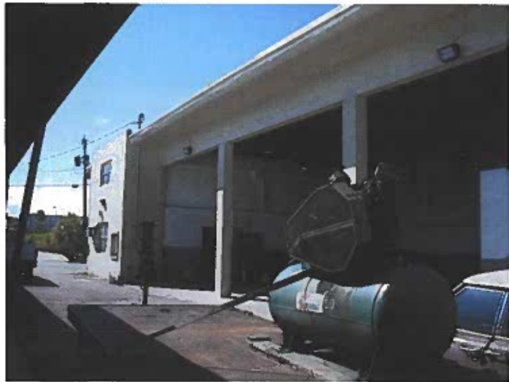
Right Side View (East Side)