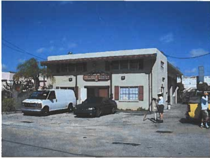
Front View (South Side)