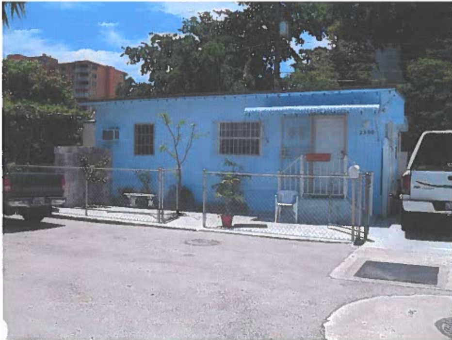
FRONT VIEW MAY 21, 2012