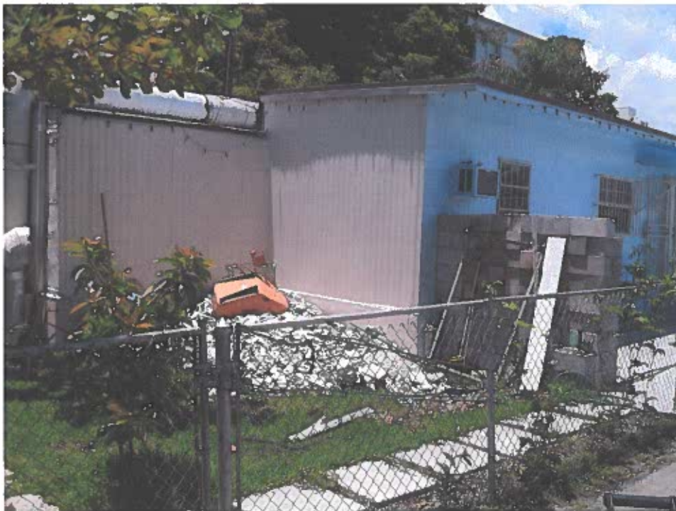
REAR VIEW MAY 21, 2012