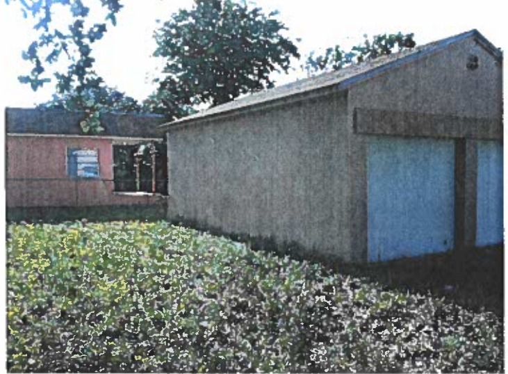
Side View: 05/03/2012