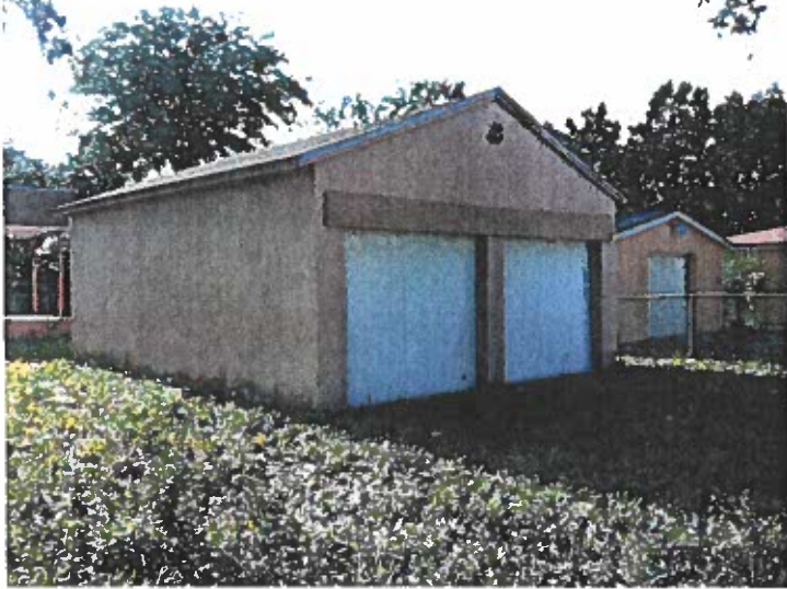
Front View: 05/03/2012