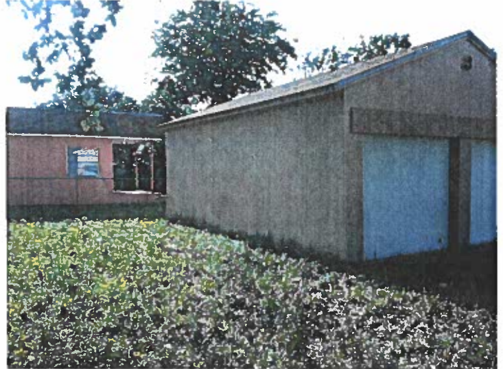
Side View: 05/03/2012