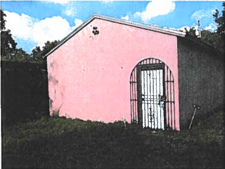
Rear View: 05/03/2012