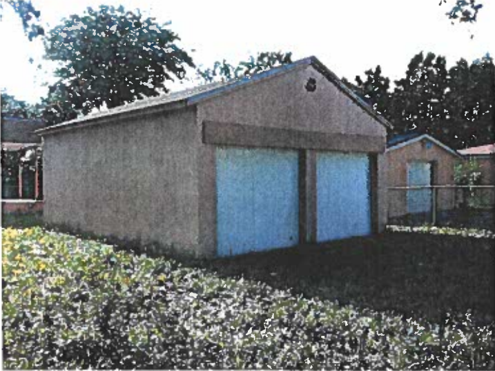
Front View: 05/03/2012