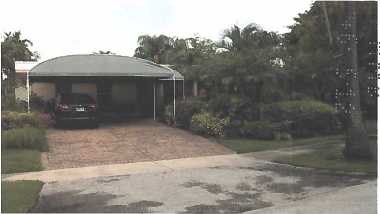
MAY 19, 2012, FRONT VIEW

If using the Elevation Certificate to obtain NFIP flood insurance, affix at least two building photographs below according to the instructions for Item A6. Identify all photographs with: date taken; "Front View" and "Rear View"; and, if required, "Right Side View" and "Left Side View." If submitting more photographs than will fit on this page, use the Continuation Page on the reverse.