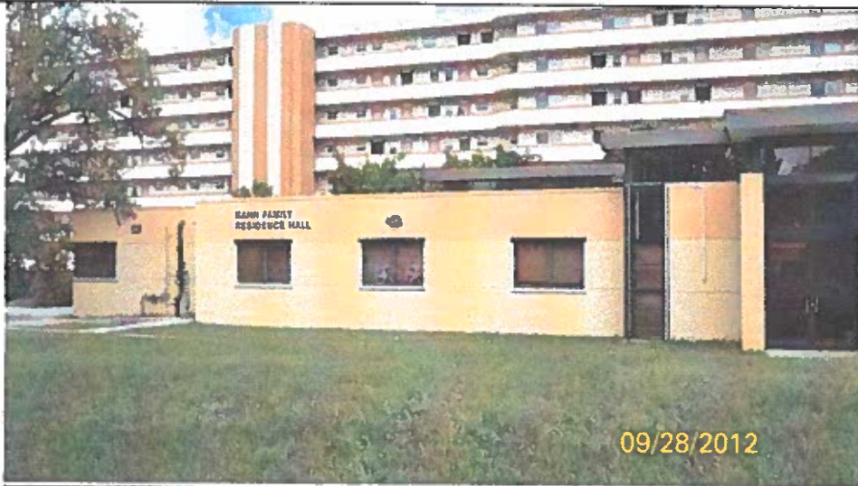
DATE TAKEN 09/28/12

If using the Elevation Certificate to obtain NFIP flood insurance, affix at least two building photographs below according to the instructions for Item A6. Identify all photographs with: date taken; "Front View" and "Rear View"; and, if required, "Right Side View" and "Left Side View." If submitting more photographs than will fit on this page, use the Continuation Page on the reverse.