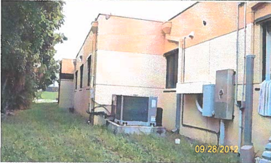
DATE TAKEN 09/28/12