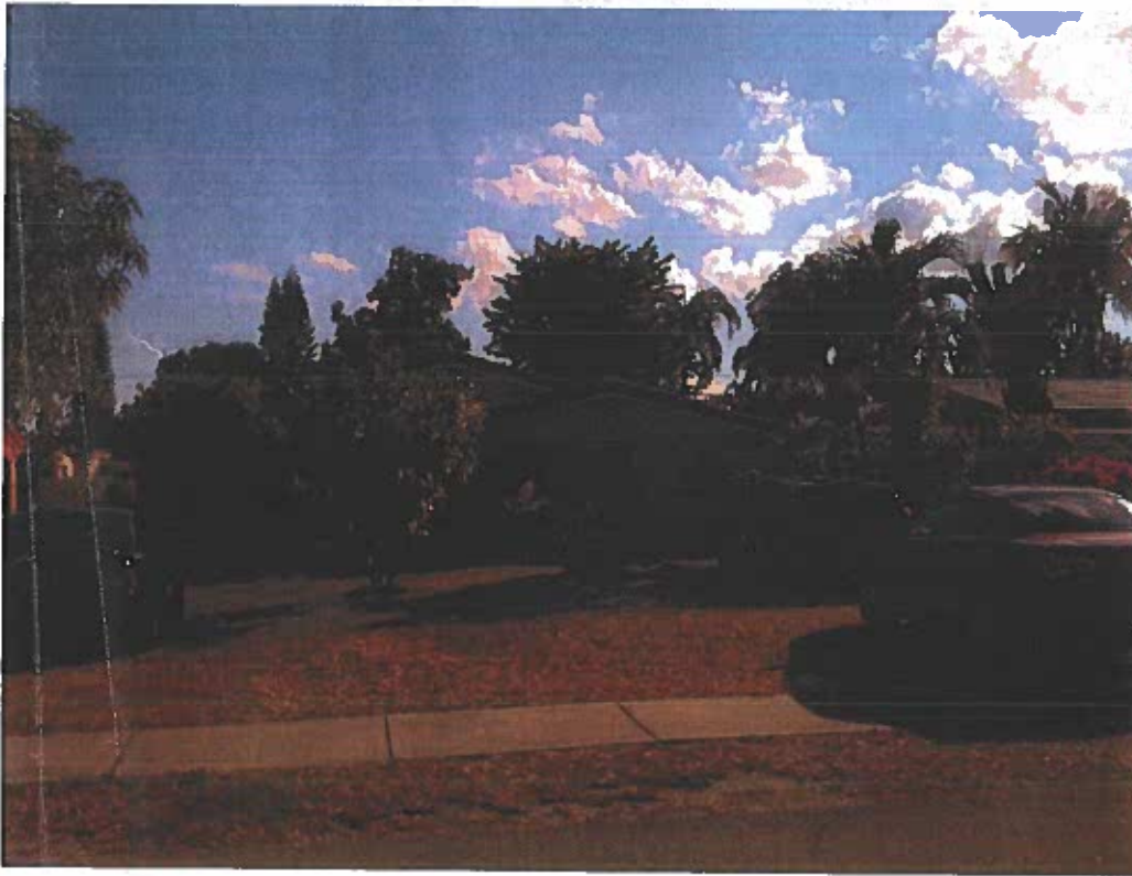
"FRONT VIEW" 1-10-12