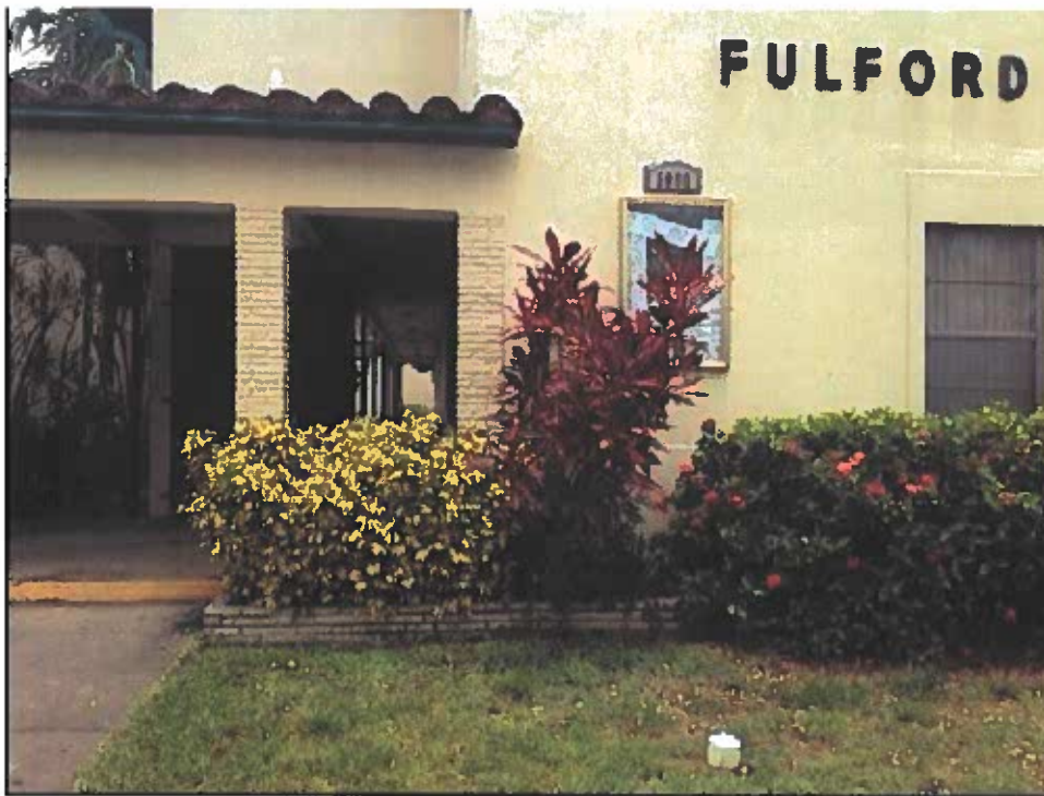
Side 2 View – Taken 07-11-2012