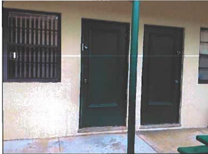
Rear View – Taken 07-11-2012