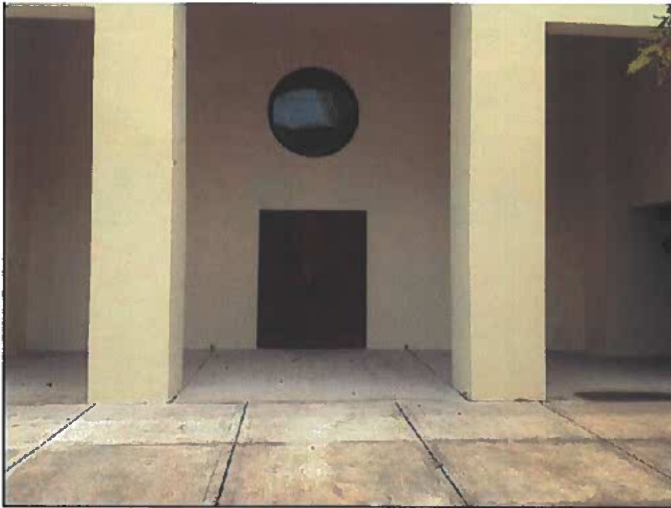
Rear View – Taken 07-11-2012