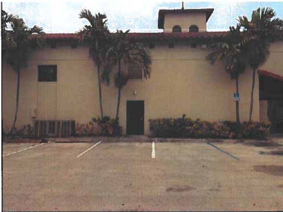
Side 2 View – Taken 07-11-2012