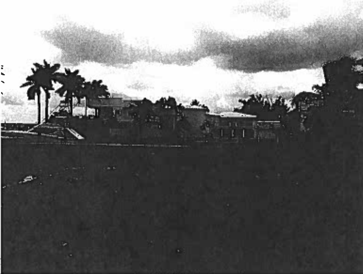
FRONT VIEW 07/24/2014

If using the Elevation Certificate to obtain NFIP flood insurance, affix at least 2 building photographs below according to the instructions for Item A6. Identify all photographs with date taken; "Front View" and "Rear View"; and, if required, "Right Side View" and "Left Side View." When applicable, photographs must show the foundation with representative examples of the flood openings or vents, as indicated in Section A8. If submitting more photographs than will fit on this page, use the Continuation Page.