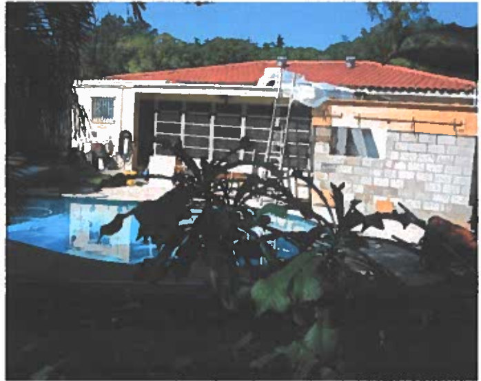
REAR VIEW (11.10.2014)