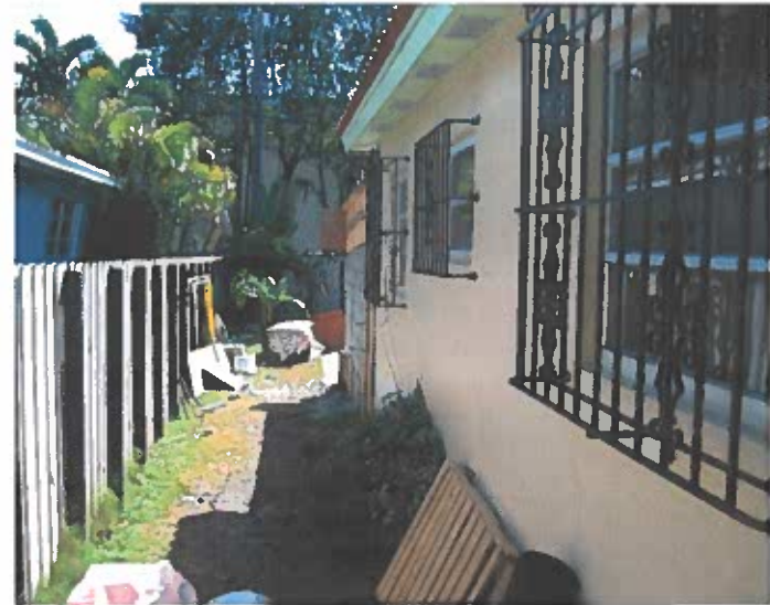
LEFT SIDE VIEW (11.10.2014)