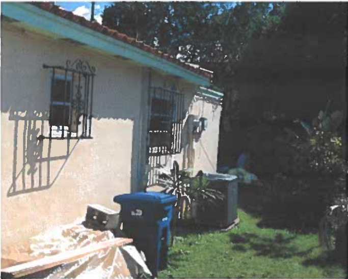
RIGHT SIDE VIEW (11.10.2014)