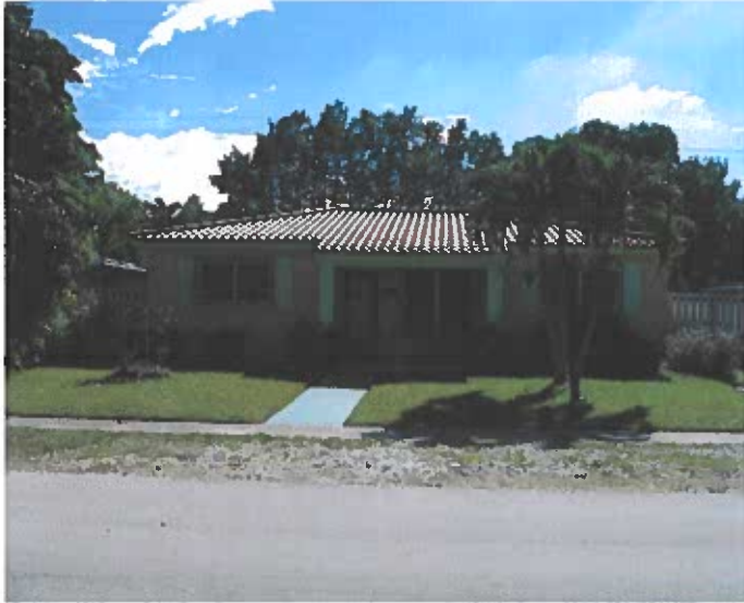
FRONT VIEW (11.10.2014)

If using the Elevation Certificate to obtain NFIP flood insurance, affix at least 2 building photographs below according to the instructions for Item A6. Identify all photographs with date taken; "Front View" and "Rear View"; and, if required, "Right Side View" and "Left Side View." When applicable, photographs must show the foundation with representative examples of the flood openings or vents, as indicated in Section A8. If submitting more photographs than will fit on this page, use the Continuation Page.