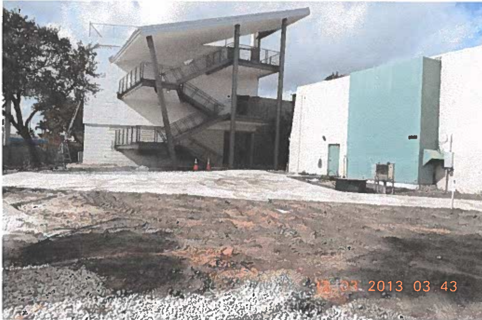
DATE TAKEN 12/03/13