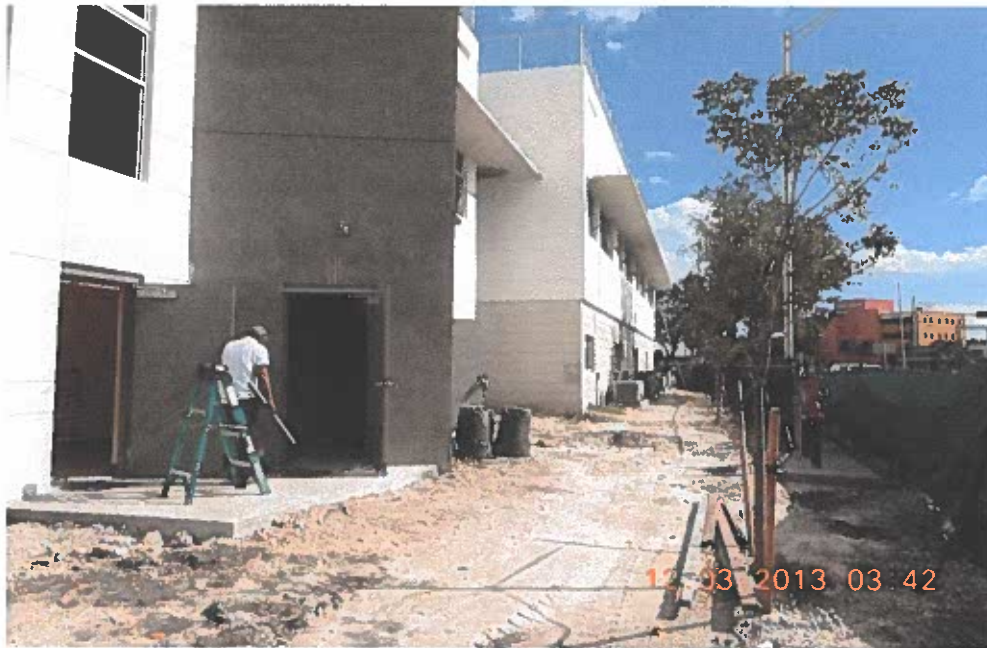
DATE TAKEN 12/03/13

If using the Elevation Certificate to obtain NFIP flood insurance, affix at least 2 building photographs below according to the instructions for Item A6. Identify all photographs with date taken; "Front View" and "Rear View"; and, if required, "Right Side View" and "Left Side View." When applicable, photographs must show the foundation with representative examples of the flood openings or vents, as indicated in Section A8. If submitting more photographs than will fit on this page, use the Continuation Page.