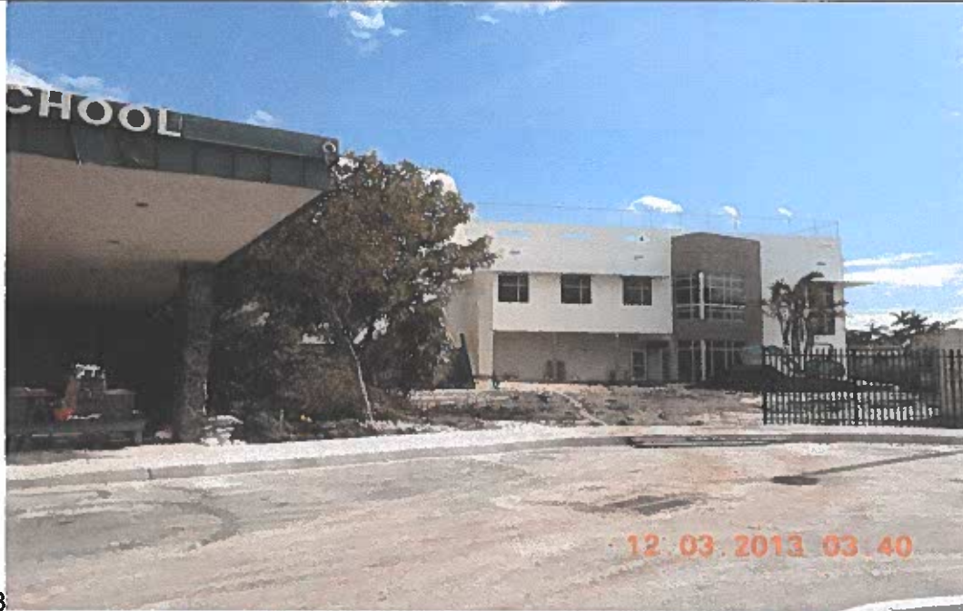
DATE TAKEN 12/03/13

If submitting more photographs than will fit on the preceding page, affix the additional photographs below. Identify all photographs with: date taken; "Front View" and "Rear View"; and, if required, "Right Side View" and "Left Side View." When applicable, photographs must show the foundation with representative examples of the flood openings or vents, as indicated in Section A8.