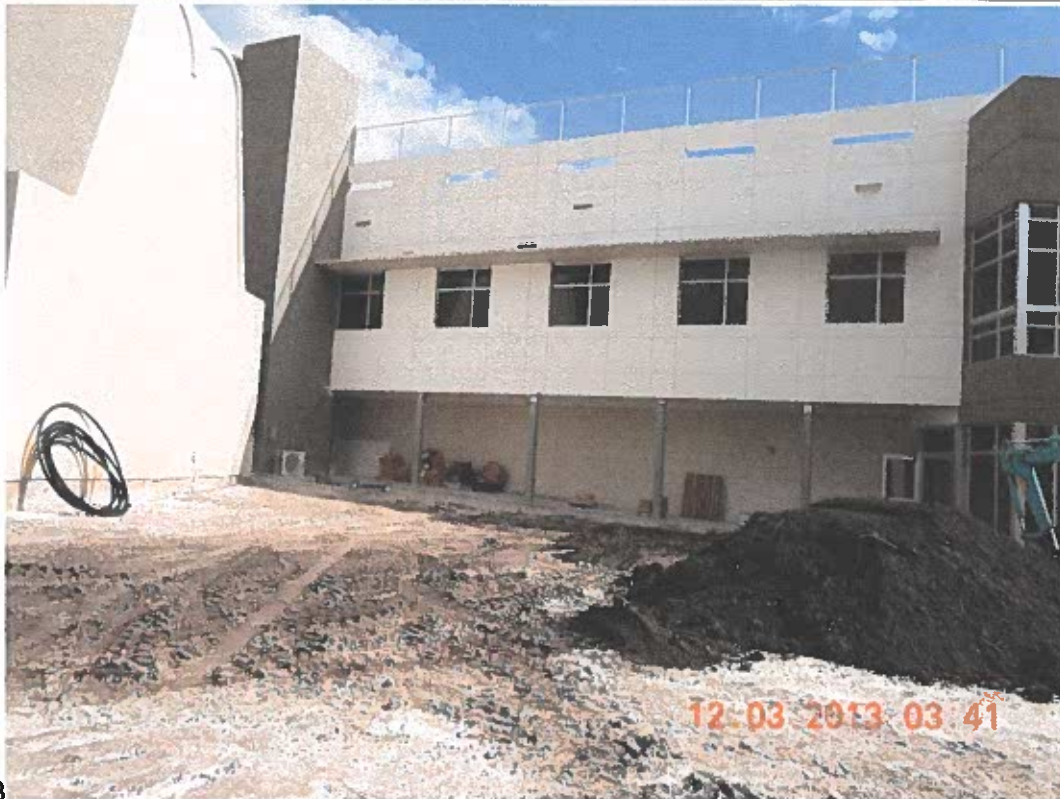
DATE TAKEN 12/03/13