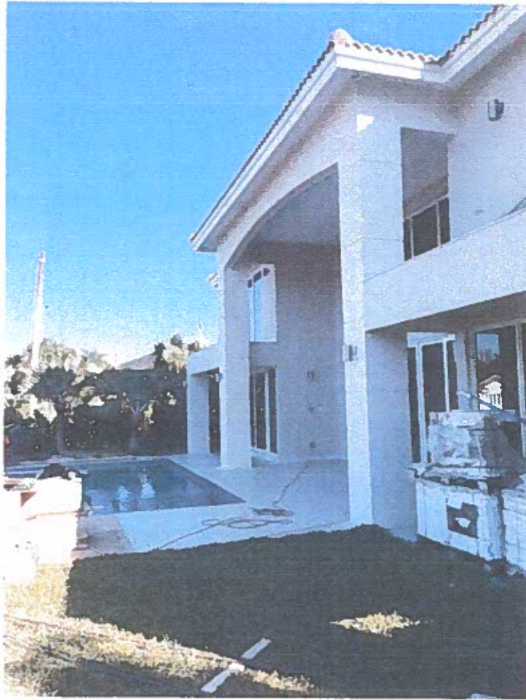
REAR VIEW DATE TAKEN 11/09/2015