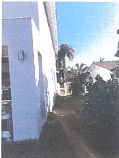
LEFT VIEW DATE TAKEN 11/09/2015