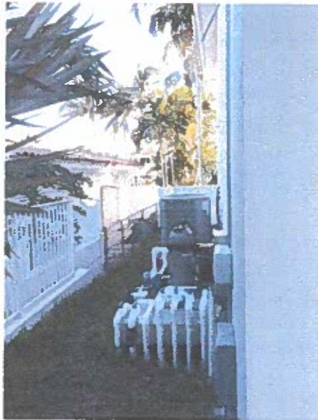
RIGHT VIEW DATE TAKEN 11/09/2015

If submitting more photographs than will fit on the preceding page, affix the additional photographs below. Identify all photographs with: date taken; "Front View" and "Rear View"; and, if required, "Right Side View" and "Left Side View." When applicable, photographs must show the foundation with representative examples of the flood openings or vents, as indicated in Section A8.