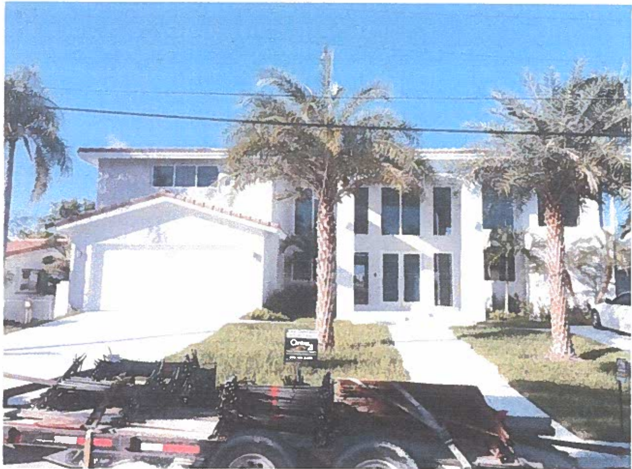
FRONT VIEW DATE TAKEN 11/09/2015

If using the Elevation Certificate to obtain NFIP flood insurance, affix at least 2 building photographs below according to the instructions for Item A6. Identify all photographs with date taken; "Front View" and "Rear View"; and, if required, "Right Side View" and "Left Side View." When applicable, photographs must show the foundation with representative examples of the flood openings or vents, as indicated in Section A8. If submitting more photographs than will fit on this page, use the Continuation Page.