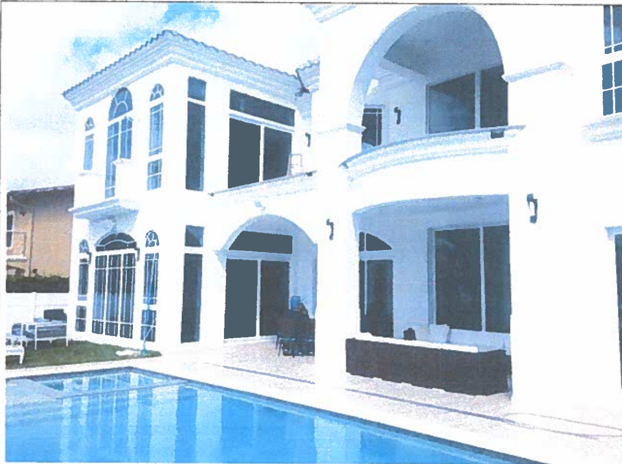
Rear View (10-26-15)

If submitting more photographs than will fit on the preceding page, affix the additional photographs below. Identify all photographs with: date taken; "Front View" and "Rear View"; and, if required, "Right Side View" and "Left Side View." When applicable, photographs must show the foundation with representative examples of the flood openings or vents, as indicated in Section A8.