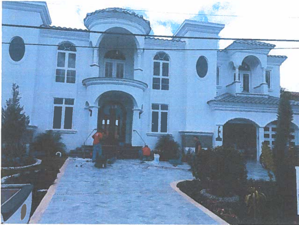
Front View (10-26-15)

If using the Elevation Certificate to obtain NFIP flood insurance, affix at least 2 building photographs below according to the instructions for Item A6. Identify all photographs with date taken; "Front View" and "Rear View"; and, if required, "Right Side View" and "Left Side View." When applicable, photographs must show the foundation with representative examples of the flood openings or vents, as indicated in Section A8. If submitting more photographs than will fit on this page, use the Continuation Page.