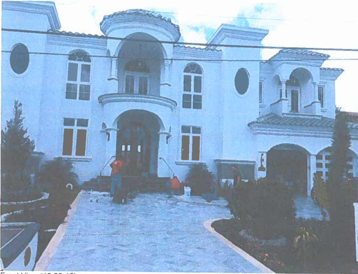
Front View (10-26-15)

If using the Elevation Certificate to obtain NFIP flood insurance, affix at least 2 building photographs below according to the instructions for Item A6. Identify all photographs with date taken; "Front View" and "Rear View"; and, if required, "Right Side View" and "Left Side View." When applicable, photographs must show the foundation with representative examples of the flood openings or vents, as indicated in Section A8. If submitting more photographs than will fit on this page, use the Continuation Page.