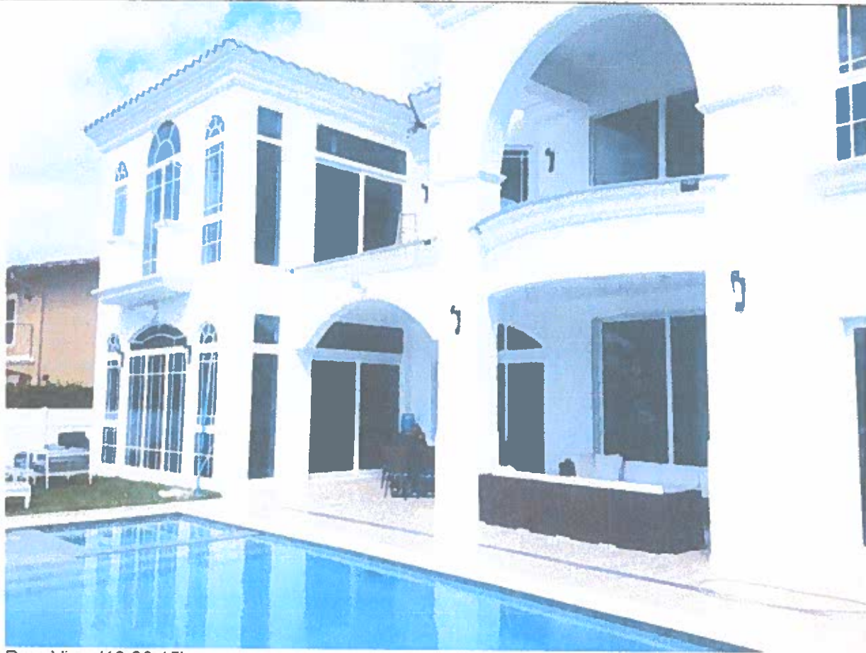
Rear View (10-26-15)

If submitting more photographs than will fit on the preceding page, affix the additional photographs below. Identify all photographs with: date taken, "Front View" and "Rear View"; and, if required, "Right Side View" and "Left Side View." When applicable, photographs must show the foundation with representative examples of the flood openings or vents, as indicated in Section A8.