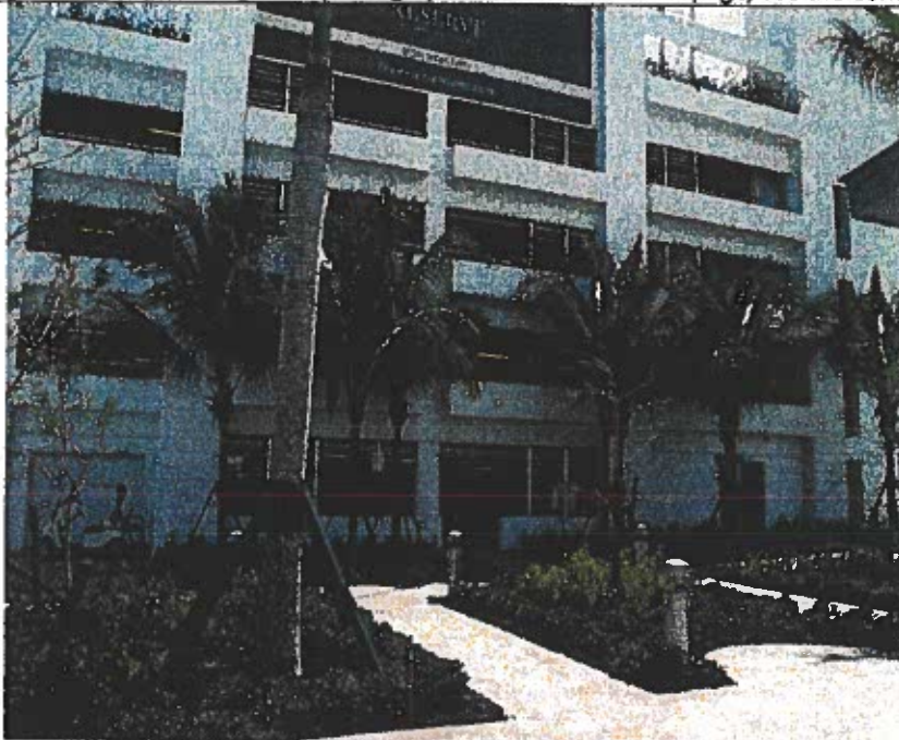
Photograph dated 4/1/2017

If using the Elevation Certificate to obtain NFIP flood insurance, affix at least 2 building photographs below according to the instructions for Item A6. Identify all photographs with date taken; "Front view" and "Rear view"; and, if required, "Right Side View" and "Left Side View." When applicable, photographs must show the foundation with representative examples of the flood openings or vents, as indicated in Section A8. If submitting more photographs than will fit on this page, use the Continuation Page.