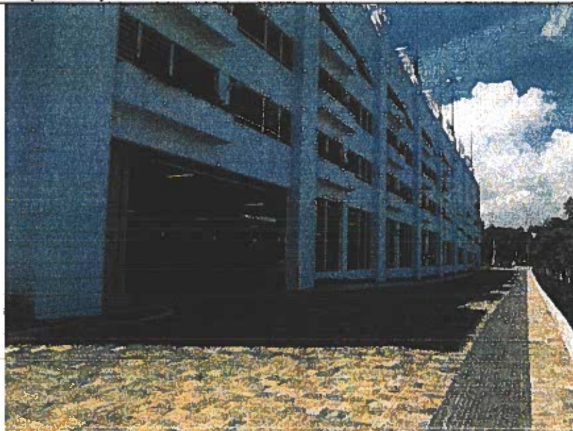
Photograph dated 4/1/2017