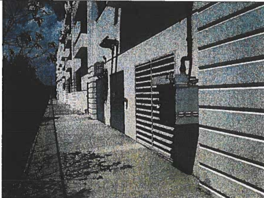
Photograph dated 4/1/2017