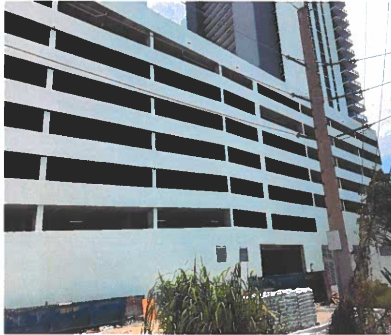
REAR VIEW – DATE TAKEN: 06-14-2018

If submitting more photographs than will fit on the preceding page, affix the additional photographs below. Identify all photographs with: date taken; "Front View" and "Rear View"; and, if required, "Right Side View" and "Left Side View." When applicable, photographs must show the foundation with representative examples of the flood openings or vents, as indicated in Section A8.