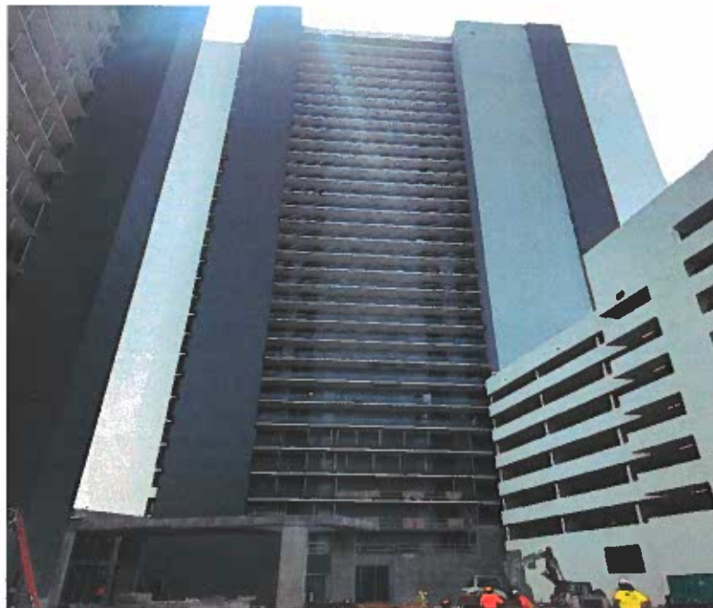
LEFT SIDE VIEW – DATE TAKEN: 06-14-18