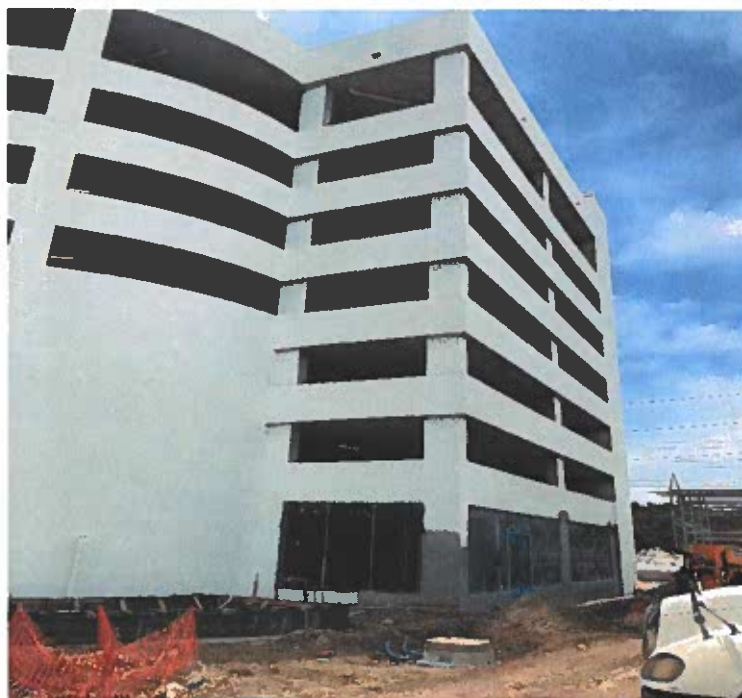
RIGHT SIDE VIEW- DATE TAKEN 06-14-2018