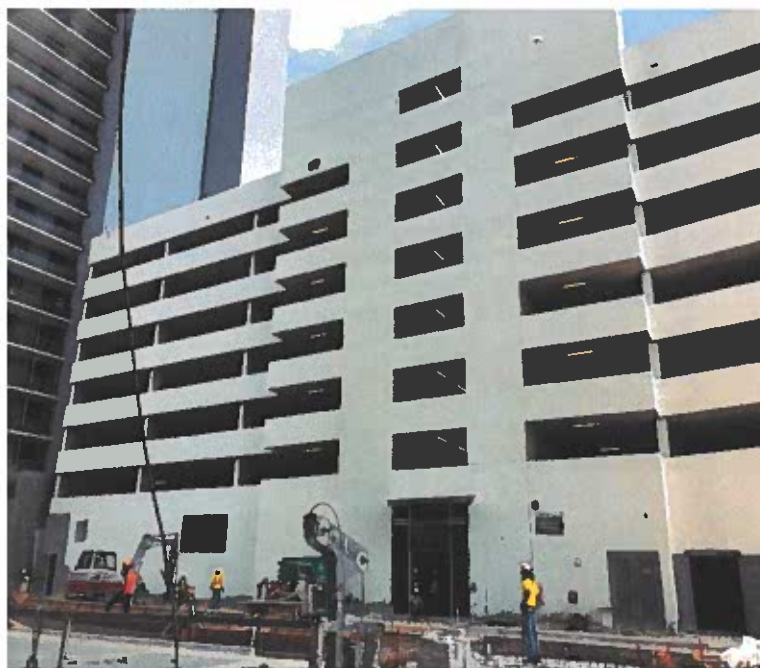
FRONT SIDE - DATE TAKEN 06-14-2018

If using the Elevation Certificate to obtain NFIP flood insurance, affix at least 2 building photographs below according to the instructions for Item A6. Identify all photographs with date taken; "Front View" and "Rear View"; and, if required, "Right Side View" and "Left Side View." When applicable, photographs must show the foundation with representative examples of the flood openings or vents, as indicated in Section A8. If submitting more photographs than will fit on this page, use the Continuation Page.