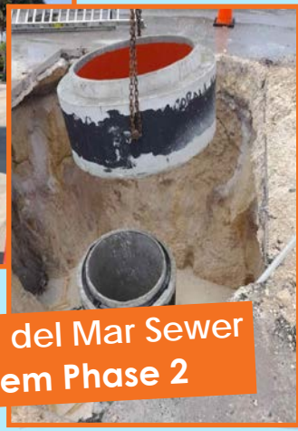
Corona del Mar Sewer System Phase 2