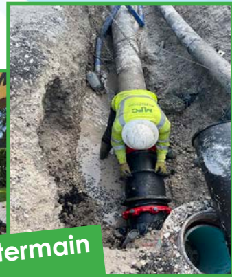
Eastern Shores Watermain Rehabilitation