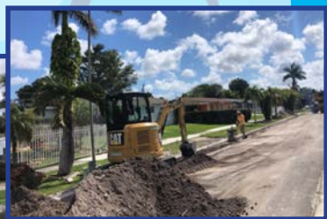
Honey Hill Watermain Rehabilitation

For the latest project updates and schedules, please visit our CIP dashboard at NMBWATER.com