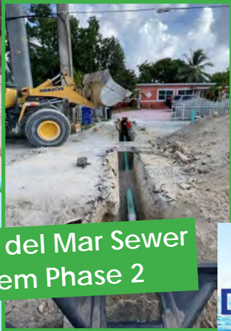
Corona del Mar Sewer System Phase 2