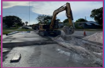
Honey Hill Watermain Rehabilitation