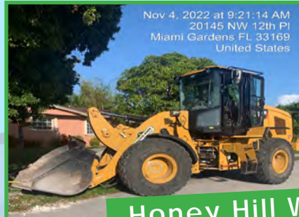
Nov 4, 2022 at 9:21:14 AM 20145 NW 12th Pl Miami Gardens, FL 33169 United States