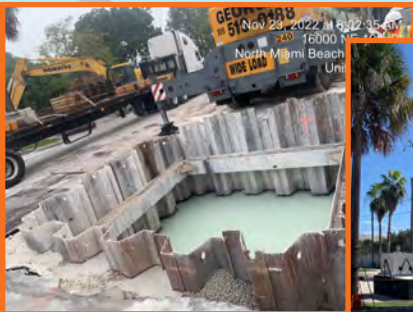
Nov 23, 2022 at 8:42:35 AM 16000 NE 1st St North Miami Beach, FL 33160 United States