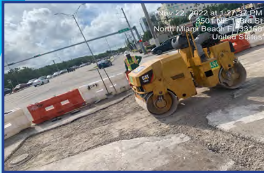
Nov 22, 2022 at 1:21:32 PM 3501 NE 17th St North Miami Beach, FL 33160 United States

Our Capital Improvement Program is producing fantastic results!