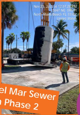
Nov 23, 2022 at 12:31:28 PM 15947 NE 19th Pl North Miami Beach, FL 33162 United States