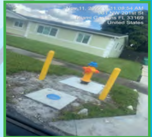
Nov 11, 2022 at 11:09:54 AM 1801 NW 201st St Miami Gardens, FL 33169 United States

For the latest project updates and schedules, please visit our CIP dashboard at NMBWATER.com