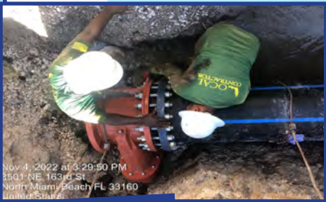
Nov 4, 2022 at 3:29:50 PM 1801 NE 163rd St North Miami Beach, FL 33160 United States